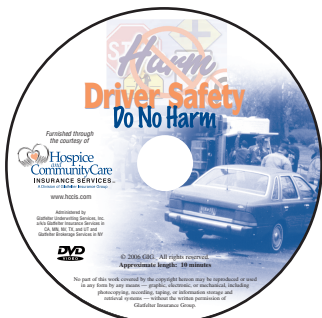
HCCIS Driver Training Item #: N01:024 - DVD