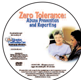
HCCIS Abuse Prevention Item #: N01:034 CD & DVD Program