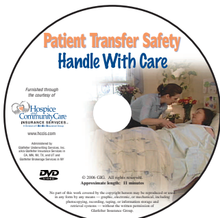
HCCIS Patient Transfer Item #: N01:025 - DVD

Contact Name: _____ Date Order Placed: _____ Required Delivery Date: _____ Agency Name: _____ Address: _____ City: _____ State: _____ Zip: _____ Telephone: _____ Fax: _____ Comments: _____ Email: _____