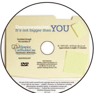
HCCIS Documentation Item #: N01:066 - DVD

HCCIS clients receive one complimentary DVD or VHS copy of each program. Additional client copy or non-client cost is listed below. Clients please include your liability insurance policy no. _____